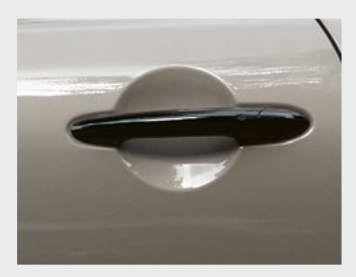
Door handles in Piano Black, as part of Piano Black Exterior

MINI logos, model badging, exhaust tips (excluding John Cooper Works models), door handles, fuel filler cap, side scuttles, front grille surround, front and rear lights surrounds and front grille blade all come in Piano Black with the new MINI Convertible Sport and John Cooper Works models, as well as the Exclusive models with optional Piano Black Exterior.