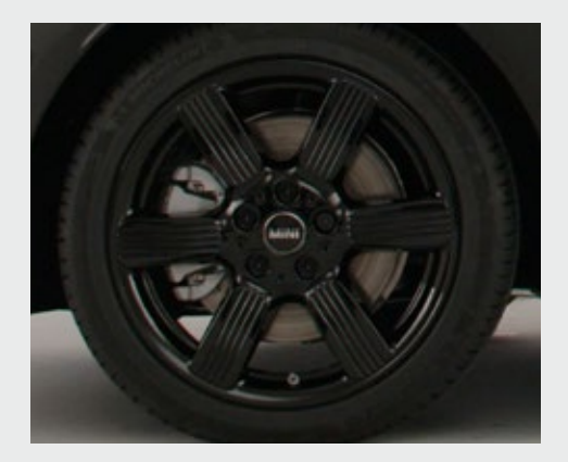
17" Pedal Spoke alloy wheels in black (optional on Classic models only)