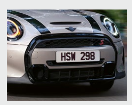
MINI logo, headlights surrounds and front grille surround in Piano Black, as part of Piano Black Exterior (optional bonnet stripes in black also shown)