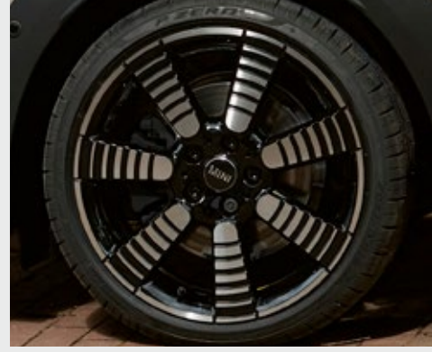
18" Pulse Spoke alloy wheels with run-flat tyres (optional on Exclusive models only)